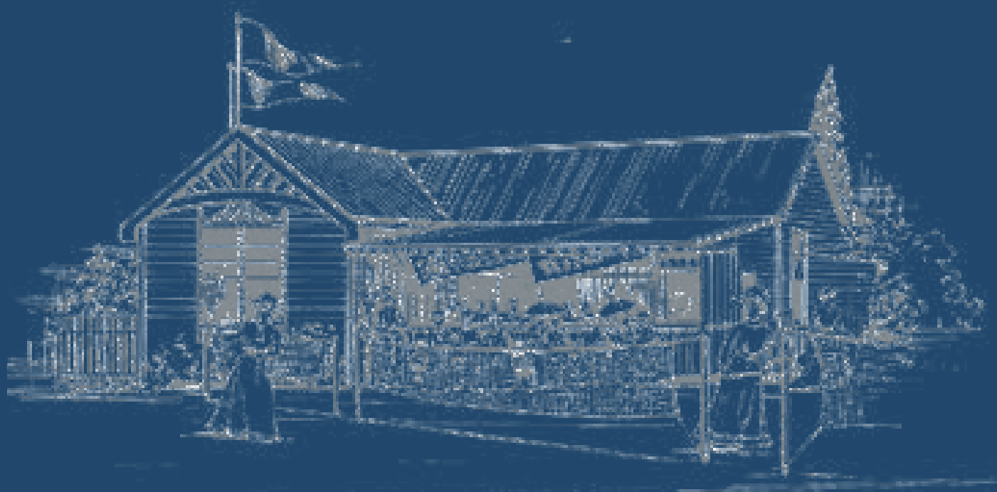
The south yarra tennis club 1891

A private sporting club in the traditional sense, the Royal South Yarra Lawn Tennis Club is open to members and their guests seven days a week, throughout the year.