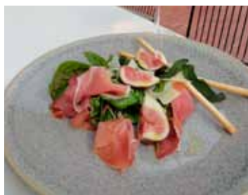
San Danielle Prosciutto with seasonal figs, pecorino and sage