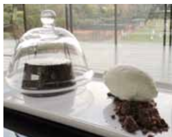
Chocolate Fondant with espresso anglaise sauce and vanilla ice cream