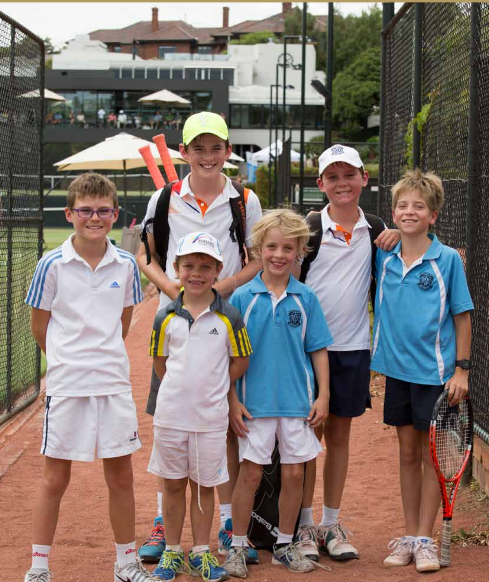
Club Championship Junior Players