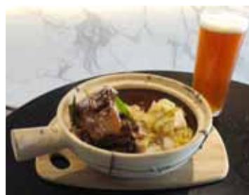
Soy & Anise Braised Pork Belly – stir fried wombok, brown rice and sticky caramel