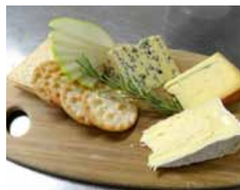
Cheeses served with sliced pear, biscuits and crackers