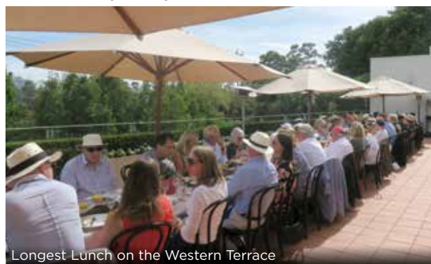
Longest Lunch on the Western Terrace

On Friday 5 April, sixty members and guests enjoyed a long lunch at a beautifully set table on the Western Terrace. The lunch was a French theme, guests were treated to a four-course lunch which included delicacies as duck liver parfait, poached salmon and palmiers, served with paired French wines. Guests were also invited to 'stretch their legs' and walk to the croquet lawn where broccoli and olive croutons were served with a 2015 Domaine Pelaquie Cote de Rhone and Laudin Rouge. During the lunch a beautiful vocalist entertained guests with her sultry French tunes – a memorable day had by all.