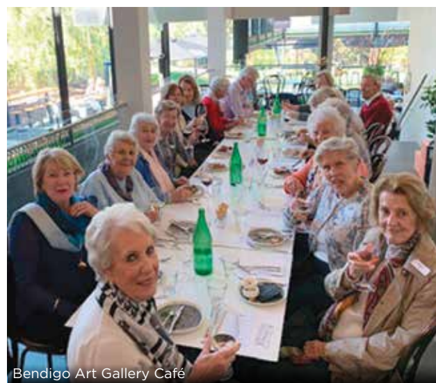
Bendigo Art Gallery Café