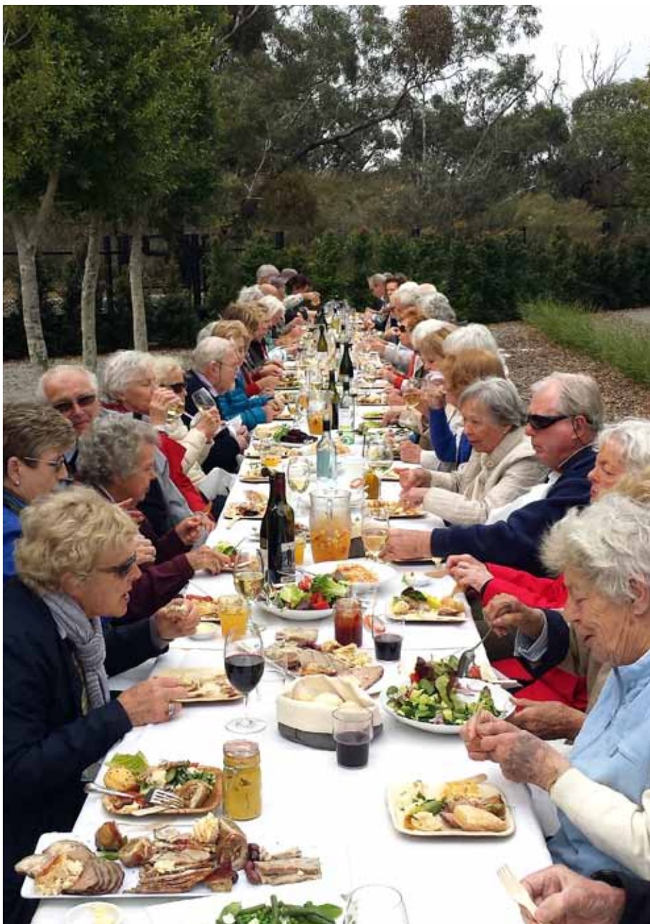
Royal Botanic Gardens Cranbourne