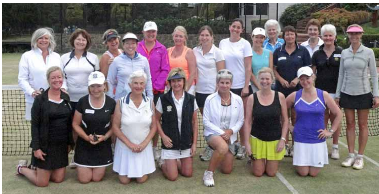
The Mid-week Wednesday ladies competition meet twice a year for a tennis and lunch get-together.